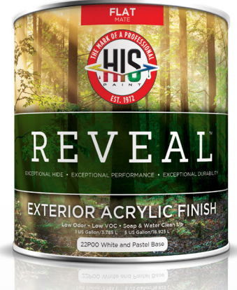
Acrylic Latex Paint

Our “professional” series Exterior Acrylic Finish is designed to withstand the most extreme weather conditions while providing maximum exterior surface protection. REVEAL is both Low Odor and Low VOC (VOC<100 g/l) due to advanced coatings technology. Performance benefits include superior adhesion to wood, metal, and light chalk, allowing it to be used on a wide variety of exterior substrates. REVEAL has excellent color resistance and superior flow and leveling characteristics. Gives freshly painted surfaces a new look.