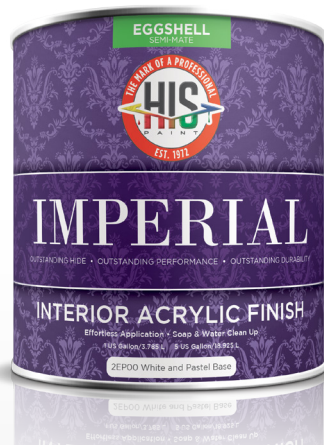
Acrylic Latex Paint

Our “premium” series interior acrylic finish provides a long-lasting and durable coating for interior walls, ceilings, and trim surfaces. IMPERIAL was formulated to provide outstanding interior surface protection and hide. Performance benefits include advanced scrub resistance to make cleaning easy, exceptional spatter and drip resistance, superior touch up properties, and effortless application. IMPERIAL levels out, flows smoothly, and dries quickly with no unpleasant odors while retaining its decorative sheen and color for the life of the paint.