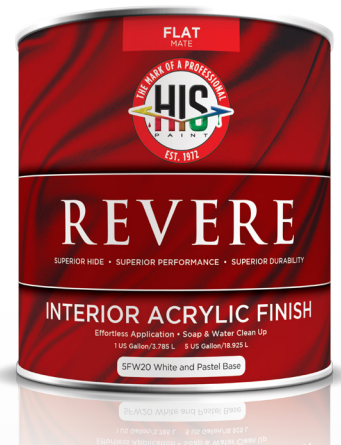
Acrylic Latex Paint

Our “professional” series Interior Acrylic Finish provides a long-lasting, durable, and protective finish for interior wall, ceiling, and trim surfaces. Performance benefits include advanced hide, low odor, superior touch up, lasting protection, easy application, and soap and water cleanup. REVERE dries quickly with no unpleasant odors while retaining its decorative sheen and color for the life of the paint. Available in flat, eggshell, satin, and semigloss finishes.