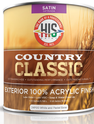
Acrylic Latex Paint

Our “premium” series 100% Pure Acrylic Exterior Finish is designed to withstand the most challenging elements and extreme weather conditions. COUNTRYCLASSIC is both Low Odor and Low VOC (VOC<50 g/l) due to advanced coatings technology. Performance benefits include outstanding adhesion to wood, metal, and light chalk, outstanding exterior surface protection, color retention, and flow and leveling. Formulated to resist to UV color fade and surface chalking. COUNTRYCLASSIC gives freshly painted exterior surfaces a new look.